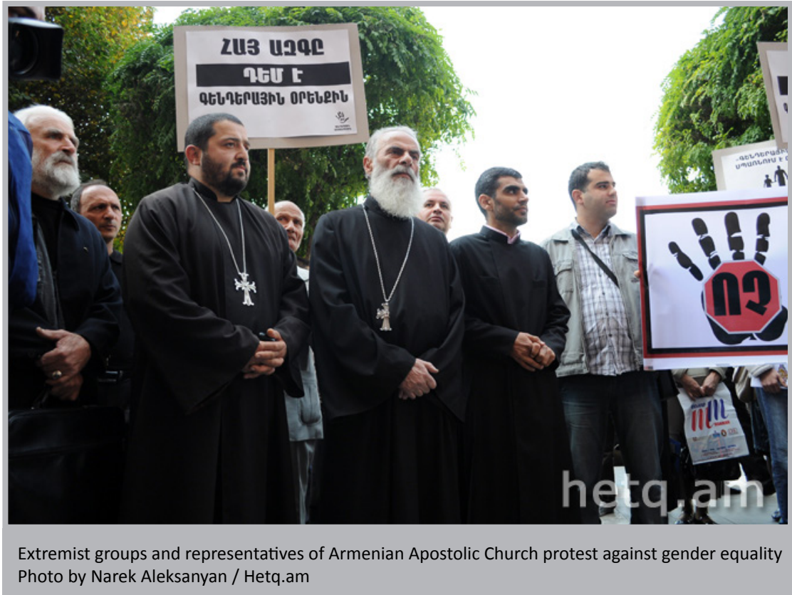
Extremist groups and representatives of Armenian Apostolic Church protest against gender equality

This became more disturbing when the traditionalists, among them priests and clergy, started spreading more and more hate messages and calling publicly to burn and attack others. In particular, one of the members of the group suggested “bombing Women’s Resource Center NGO office in a way that DIY pub was bombed”. Moreover, they are attacking and spreading misinformation, intolerance and hatred towards human rights organizations, youth organizations, human rights defenders, activists, and researchers covering gender issues and fighting against gender-based violence, gender inequality, and gender discrimination.