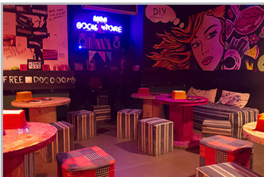
DIY pub in Yerevan, before and after the hate crime

Oganezova contends that there have been violations of a number of rights guaranteed by the European Convention for the Protection of Rights and Fundamental Freedoms. In particular, she contends that the respondent state committed clear violations of the right to freedom from inhumane and degrading treatment (Article 3), the right to respect for private and family life (Article 8), and the right to freedom of expression (Article 10). Additional claims are made in respect of effective remedy of violations of certain rights and freedoms and non-discrimination.